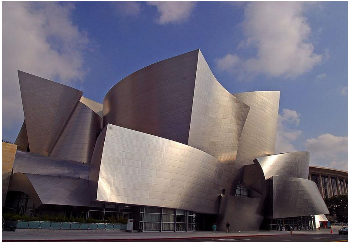
❖ Walt Disney Concert Hall, Los Angeles (Designed by Frank Gehry)