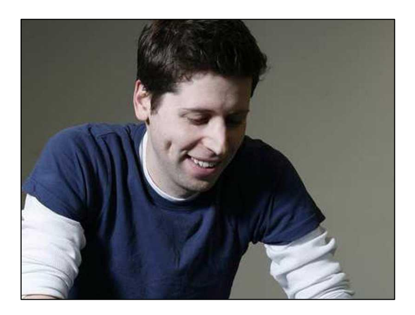
I turned 30 last week and a friend asked me if I'd figured out any life advice in the past decade worth passing on. Here is a cleaned up version of my answer: